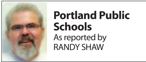
Portland Public Schools As reported by RANDY SHAW

Remember to always be safe and take your breaks, safety before schedule.