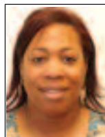
TriMet Powell As reported by ROSE JORDAN-FAIRLEY

Stay safe, drink your fluids, and use the restroom when you need to.