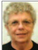
Lane Transit District As reported by CAROL ALLRED

Solidarity and unity really does make a difference. Get involved and stay involved. Remember, it's your union and it's your life! Only together can we make deference. Our next union meeting will be on June 23, 2008. To all of you, I hope you have a wonderful Independence Day!