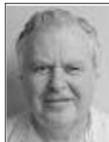
TriMet Laidlaw Lift As reported by LES GREEN

I hope you all have a safe end enjoyable summer.